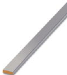
PEN conductor busbar, 3mm x 10 mm, length: 1000 mm

Please be informed that the data shown in this PDF Document is generated from our Online Catalog. Please find the complete data in the user's documentation. Our General Terms of Use for Downloads are valid ( http://download.phoenixcontact.com )